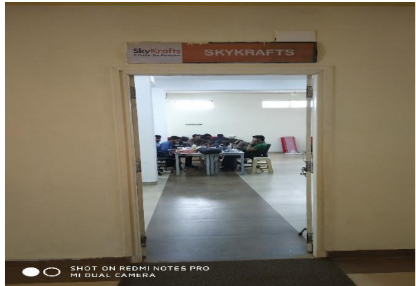
Pic02: SKY kraft aerospace pvt. Ltd.