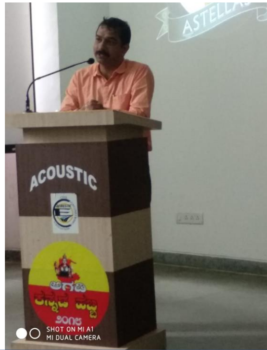
Address on the need and importance of Vocational training- need of an hour for Electrical Department Students.