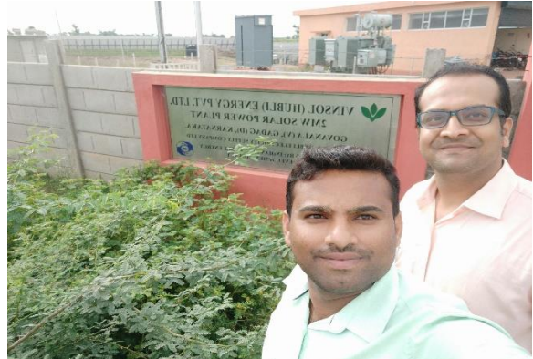
Pic01: 2MW Gonal Solar Power plant visit