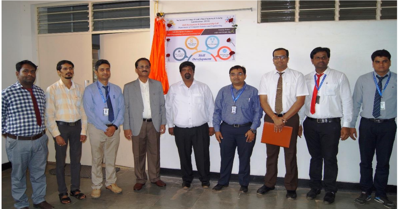
Inauguration of Skill Development lab on PHP - Advanced learning