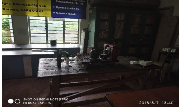
Pic03: RUDSET domestic appliance repair center