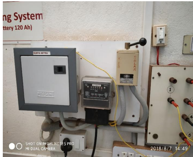
Pic04: Suryamitra training center of SDM college

I and my team would personally like to thank SKSVMACET Management, beloved Principal and Chief Administrative officer for their support towards this initiation as a part of Skill Development program.